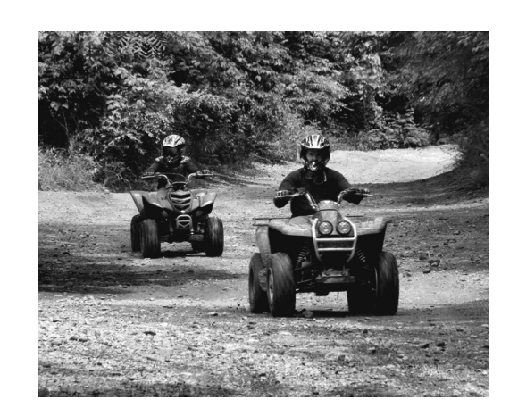
Turkey Bay Off-Highway Vehicle Area 20 Miles | 26 Minutes from Hillman Ferry

What's Happening in Land Between the Lakes During Your Stay: