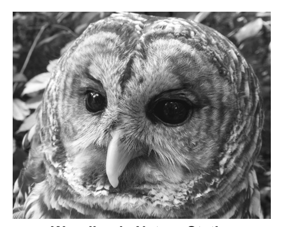
Woodlands Nature Station 11 Miles | 18 Minutes from Hillman Ferry