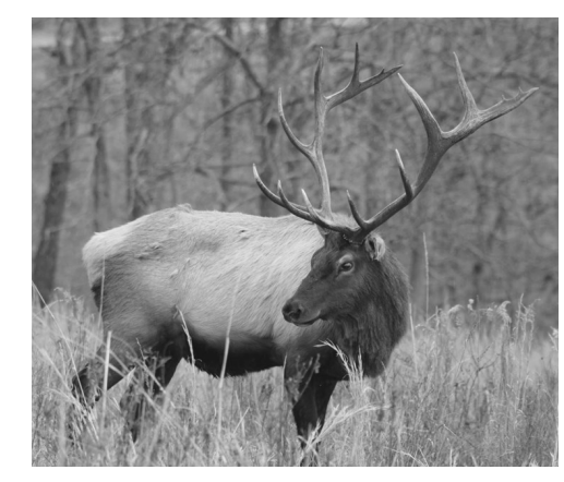
Elk & Bison Prairie 16 Miles | 20 Minutes from Hillman Ferry