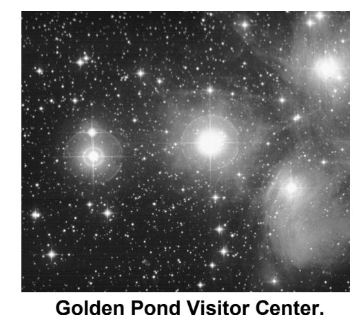
Planetarium & Observatory 18 Miles | 23 Minutes from Hillman Ferry