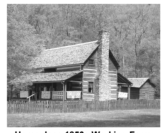
Homeplace 1850s Working Farm 29 Miles | 38 Minutes from Hillman Ferry