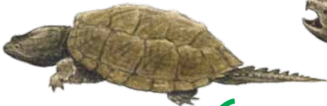
COMMON SNAPPING TURTLE Legal to take