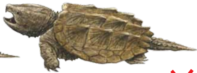
ALLIGATOR SNAPPING TURTLE Illegal to take